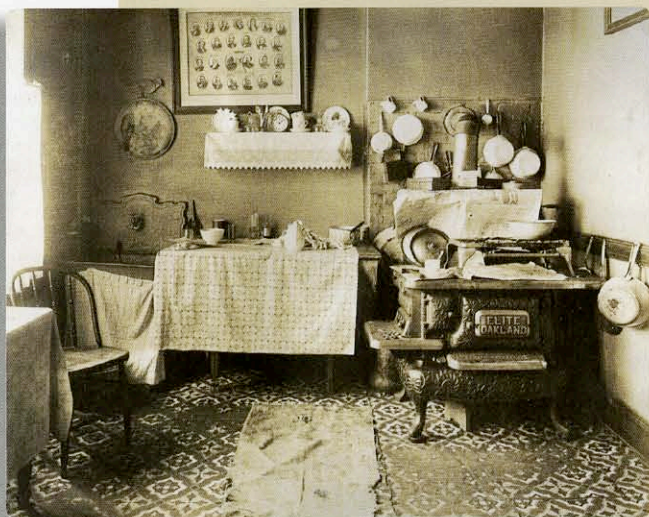
WESTCHESTER COUNTY ARCHIVES

Some files also include defendants’ personal items, perhaps collected during the investigation or used as evidence during the trial, such as birth or marriage certificates, naturalization papers, photographs, notebooks, and personal letters. Sometimes the files don’t end with the conviction of the defendant; often they contain letters that describe prison conditions or the hardships that imprison-